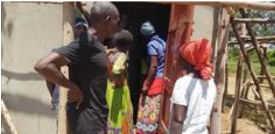
The commissioning of the water project.